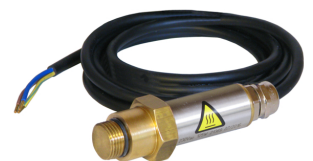
Optional heater for cold weather applications available