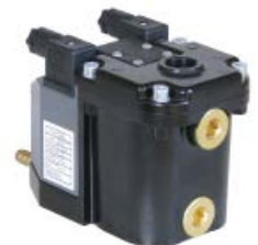
Multiple inlets offer installation flexibility