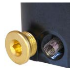
Integrated mesh filter protects the valve against large contaminants