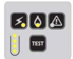
Digital sight port/level indicator